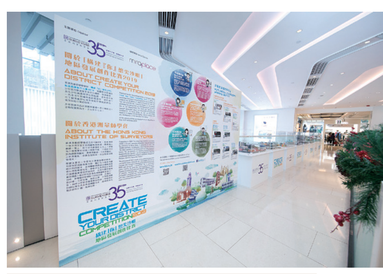
構建『你』想尖沙咀地區發展創作比賽得獎作品在 11 月 3 日至 17 日於尖沙咀一個商場內展出。