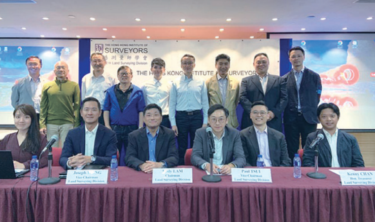
LSD Annual General Meeting

CPD: Technical Exchange and Collaborative Opportunities between Hong Kong and Pakistan on Remote Sensing and UAV Technology