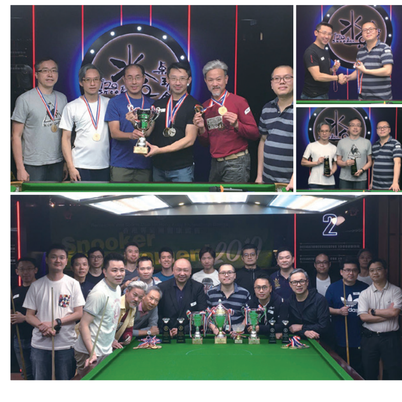
The recruitment of players is always open to all qualified members, probationers, and student members. We look forward to seeing you.

The HKIS Snooker Team is looking for new blood. Please feel free to let the Sports and Recreation Committee know if you want to join the team. Training will be provided.