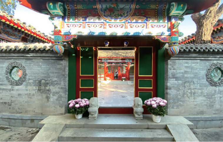
2019 年度北京区域会员 CPD 活动已经落幕,还有一场答谢会员和业界朋友们的年底聚餐 即将在 12 月 12 日举行,我们在南池子大街 80 号精致古典的四合院与您相聚!