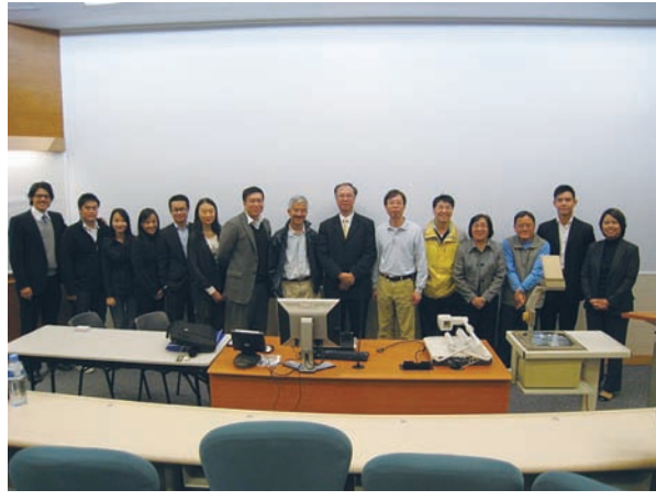
Introduction of HKIS during oral exam training for Form 5 and Form 7 students

In December 2008, YSG sponsored the venue for an oral exam training for Form 5 and Form 7 students organised by the charity 'Air Monitor' for the third consecutive year. As a sponsor of the event, YSG had a chance to talk to about 150 students in the two seminar sessions. We showed the HKIS corporate video to them and briefed them about the six types of surveyors in the HKIS.