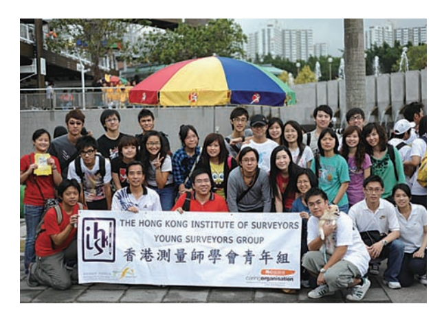
Career Talk - Success in Surveying Career in an Uncertain Market

leisurely walk along the Tolo Harbour Cycle Track for 1.5 hours on the Sunday morning.