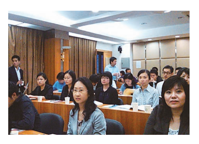
Joint Mingle Party with HKICPA and HKIE YMC

On 12 Jun 2009, YSG jointly organized a mingle party with the HKICPA and Young Members Committee of the Hong Kong Institute of Engineers (HKIS). It was held in a trendy club called Pi in Central with about 200 participants.