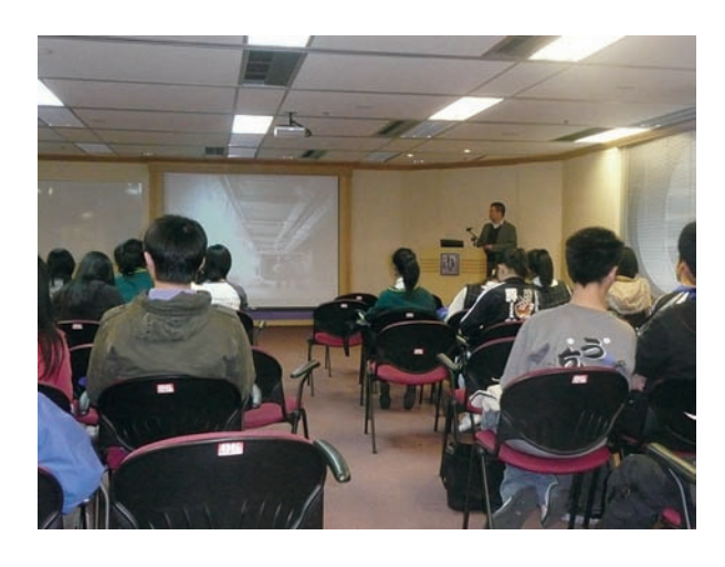
Joint Visit to HKU Surveying with Board of Education

In December 2008, YSG sponsored the venue for an oral exam training for Form 5 and Form 7 students organised by the charity 'Air Monitor' for the third consecutive year. As a sponsor of the event, YSG had a chance to talk to about 150 students in the two seminar sessions. We showed the HKIS corporate video to them and briefed them about the six types of surveyors in the HKIS.