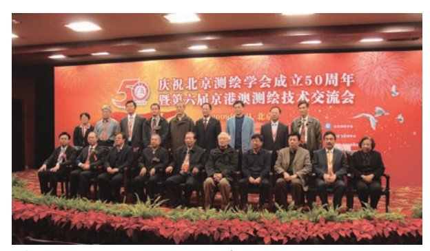
6th Beijing - Hong Kong - Macau Conference on Geometics