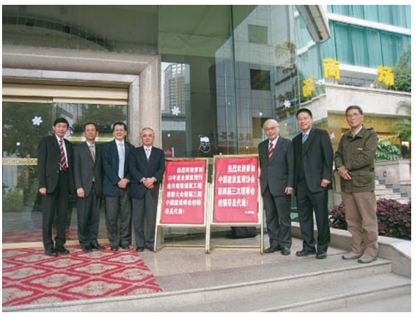
Delegates from the HKIS attended the CAEC Summit Conference in Namning in December 2009.