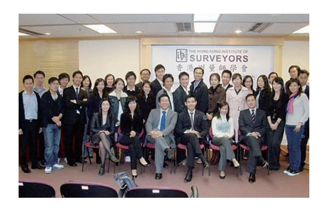
Sustainability - To attract more young members to join YSG and the profession, and enable our sustainable growth

YSG is obliged to take care of 4,771 members and we are representing the voice of 40% of professional members. At the YSG AGM held in December 2008, we set up five missions this year, namely sustainability, serving young members, demonstrate professionalism, going international and enhance local knowledge. With the hard work of our YSG team, we made remarkable achievements for these five missions during the past 12 months, and I am pleased to report some of them below.