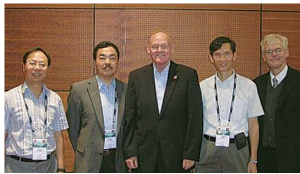
The 7th FIG Regional Conference, Hanoi, Vietnam