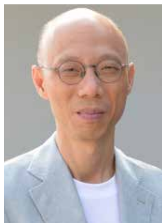
環境局局長黃錦星