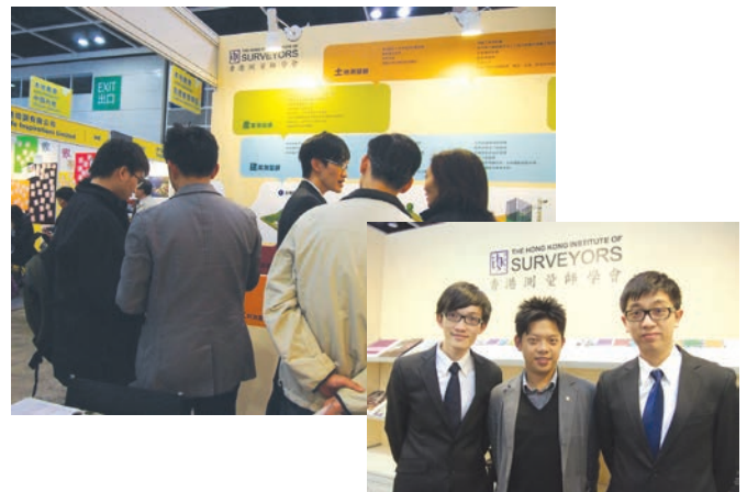
Our student helpers from LSGISS introducing surveyors’ work at the booth