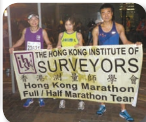
HKIS runners joining Full Marathon