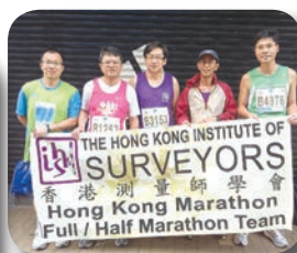
Half Marathon team