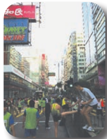
Getting ready for the marathon in the morning