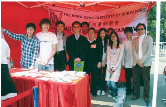
Volunteers, the President and BSD Chairman at the HKIS booth

The Institute was invited to participate in the Building Safety Carnival 2010 held on 17 January 2010, which was organised by the Buildings Department, Hong Kong Housing Society and Urban Renewal Authority. The BSD and YSG jointly set up a booth with games to promote building surveying and the importance of building safety. The President visited our booth to show his support to members. We took this opportunity to distribute our DVD on the importance about regular building maintenance and management. Our booth was well received by visitors and a queue was always found in front of our booth.