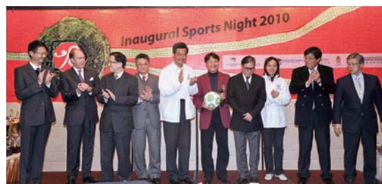
Kick-off ceremony by the Guests of Honour - the Hon Mr CY Leung GBS, the Hon Mr Timothy Fok GBS, Chairman of Sports Committee and the Presidents of 8 Professional Bodies (HKICPA, HKIA, HKBA, HKDA, LSHK, HKMA, HKIP & HKIS)