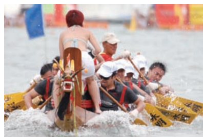
Become a HKIS Paddler - We need you!