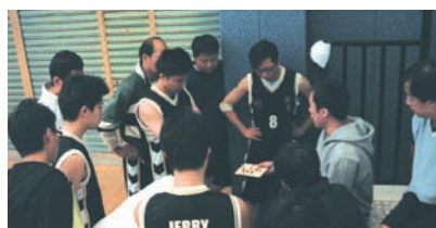
Instructions by the coach