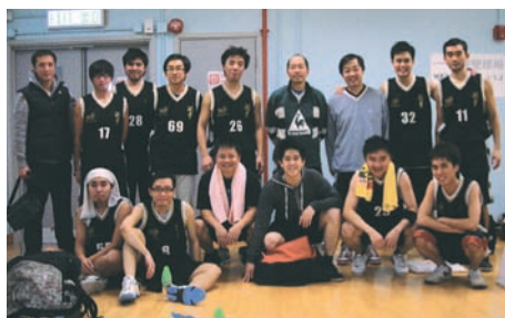
HKIS Basketball Team

The Joint Professional Basketball Tournament 2010 has just begun. With more than 20 teammates, our professional coach has been guiding us to become a strong team.