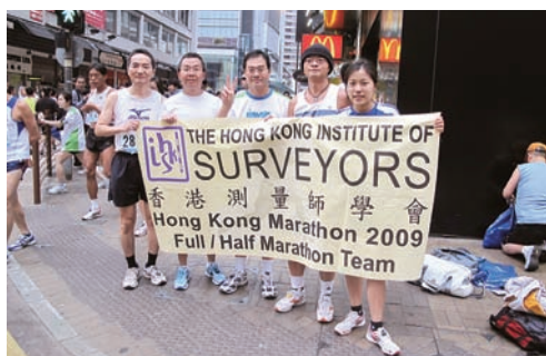
Join the HKIS Running Team