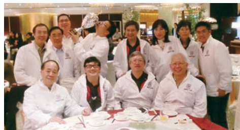
HKIS Table Tennis Team in the Joint Professional Sports Night with the Champion Trophy

The Champion - HKIS Table Tennis Team had arranged two friendly matches with Widnell Ltd and the Housing Department. The teammates are keen to maintain and upgrade their skills through different competitions. More interested players are welcomed.