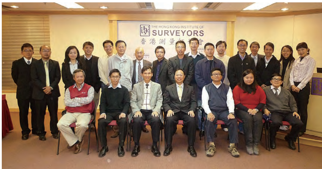
The 2009-2010 LSD Council

of Geography and Planning of Sun Yat-Sen University 中山大學 (SYSU). The proposed programme curriculum has a 2 years + 2 years structure. Students admitted to the programme are required to study 2 years in SYSU and 2 years in HK PolyU.