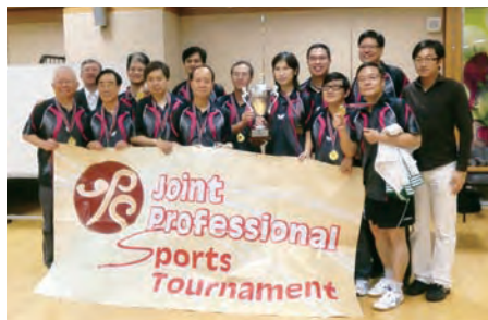
Celebration with the whole team