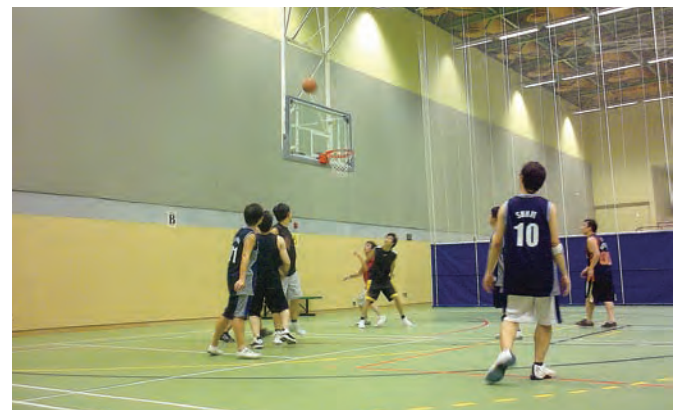
Practice session on Winter Solstice (22 December 2009)