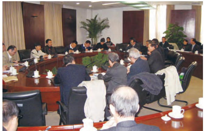
MoHURD meeting held on 15 December 2009

Amongst others, the meeting was briefed of the supplemental agreement signed between CECA and HKIS this year and the arrangement of the second reciprocity assessment for cost engineers in the Mainland.