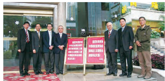
Delegates from HKIS attending the CAEC Summit Conference

Moreover, scope of conversion including necessary upgrading works at old buildings so as to meet latest statutory requirements like MoE, BFA and fulfill modern standard of provisions like HVAC were also illustrated. Our China counterparts were enlightened on the ways to save time and money in development projects without the need to demolish the existing building structures. I had joined with 7 other delegates from HKIS to attend the summit conference. It was a precious opportunity for practitioners in Hong Kong to share their experience with our Mainland counterparts.