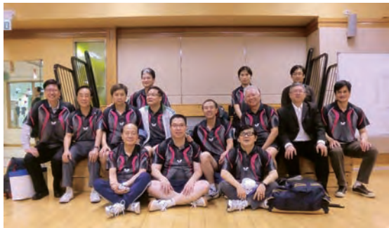
HKIS Table Tennis Team

Let's congratulate the HKIS Table Tennis Team together.