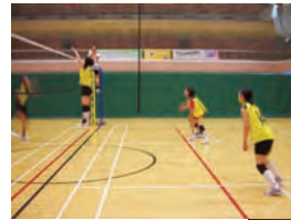
Getting the Bronze Medal

Sports Centre. It was also the first time the HKIS had participated in this tournament competing with the other professional bodies. The result was most encouraging.