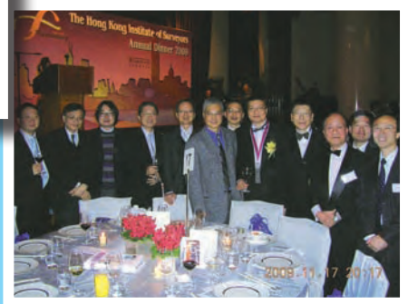
HKIS 25 th Anniversary Annual Dinner on 17 November 2009