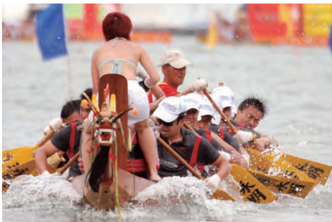
Become a HKIS paddler!