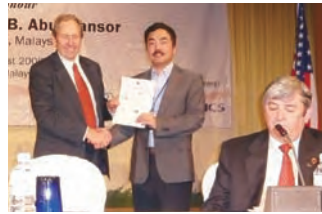
Presentation of the accreditation agreement to HKIS