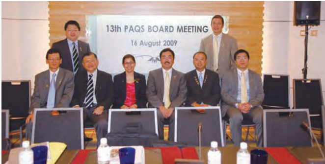
Representatives of HKIS and ISM in the PAQS Board Meeting