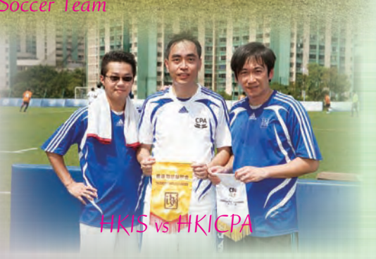
HKIS vs HKICPA

HKIS, the 1 st runner-up out of 6 soccer teams from different professional bodies including HKICPA, HKIA, HKBA, LawSoc, HKIP and HKIS. Well done!