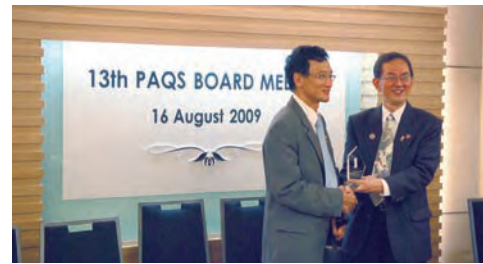
Exchange of gifts after the PAQS Board Meeting

This allows young QS practitioners of the PAQS member organisations to broaden their knowledge of quantity surveying practice in other PAQS countries through the advice and guidance from experienced practitioners in the region.