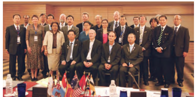
Group photo after ICEC meeting