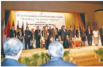
Opening ceremony of 13 th PAQS Congress