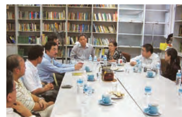
Meeting between ISM and HKIS