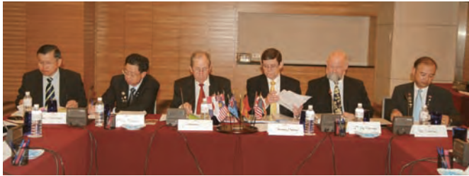
Officers of PAQS chairing the PAQS Board meeting