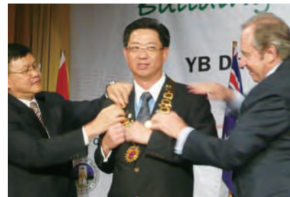
Handover ceremony to new PAQS Chairman witnessed by past PAQS Chairmen