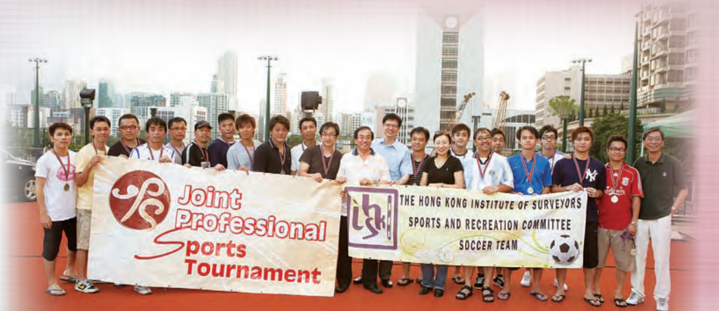
Getting the Silver Medal