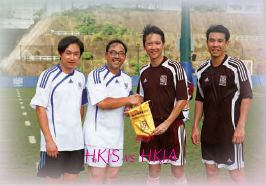
HKIS vs HKIA