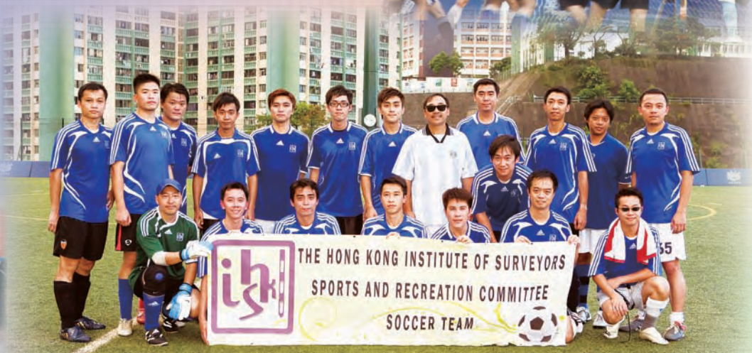
HKIS Soccer Team