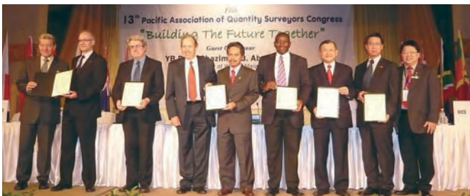
Signing of the KL Pack

The conference closed with a simple but serious ceremony. Two important documents were signed at the same occasion. Eight member organisations including HKIS signed an accreditation agreement to subscribe the PAQS accreditation scheme. The six participating associations signed a KL Pact to agree in principle to further develop and foster a global community of leaders in the quantity surveying profession.