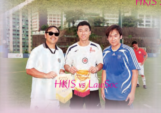
HKIS vs LawSoc