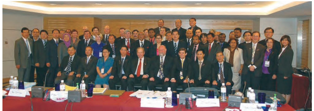
Group photo of representatives after the PAQS Board Meeting