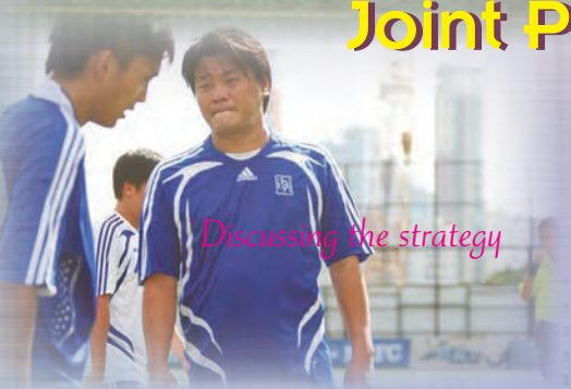
Discussing the strategy