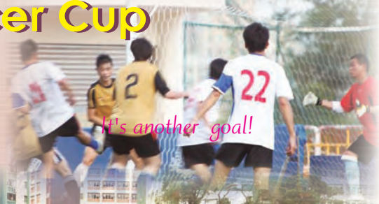
It's another goal!