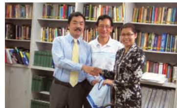
Presentation of souvenirs to the ISM President by the HKIS President and QSD Chairman

They further shared their experience in running the institute during the lunch. The visit was valuable and there should be something we could learn from their way of operation. I would like to take this opportunity to thank the ISM for their kind reception and hospitality.