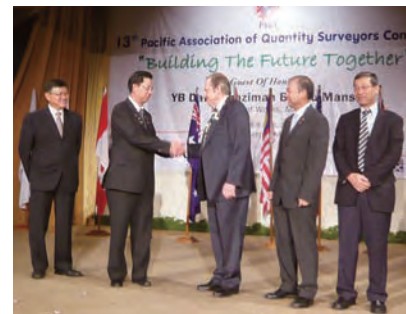
Handover ceremony to new PAQS Chairman witnessed by past PAQS Chairmen